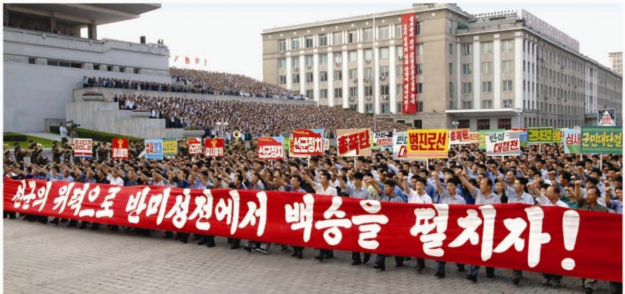
Pyongyangites have a mass rally on the June 25 Anti-US Imperialist Day.

However, the US and the south Korean regime answered the DPRK's sincere overtures and efforts with arms buildup and large-scale joint military exercises. The US deployed more than 60 per cent of its nuclear submarines around the Korean peninsula and in January this year assigned a nuclear-powered aircraft carrier-led flotilla additionally to the 7 th Fleet which is basically active in the North-east Asian region including the Korean peninsula. In February last it shipped into south Korea an army battalion equipped with dozens of tanks and armoured vehicles. In the following month US nuclear-powered submarine Columbus , the Blue Ridge which is the flagship of the 7 th Fleet and an Aegis ▶