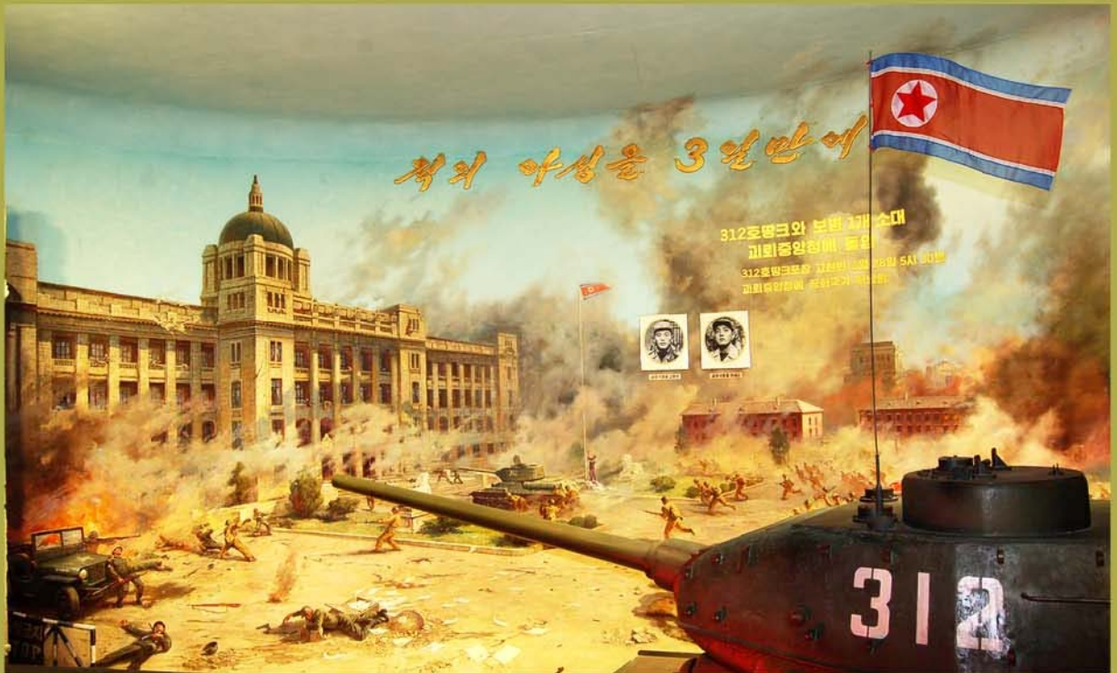
A large-sized picture of the operations for liberation of Seoul.

► cal, economic and military measures to carry out the policy and organized and led military operations in the frontline to the victory. Thanks to his command the KPA units administered lethal blows to the US aggression forces and the south Korean puppet army through many operations and battles including the battle in which they captured the enemy's capital city of Seoul in three days after the war broke out, the Taejon liberation battle that is a model of modern encirclement battle, the Jumunjin torpedo boat battle recorded in the world naval battle history, and the battle in which KPA units crossed Raktong River over night defying showers of bombs and shells.