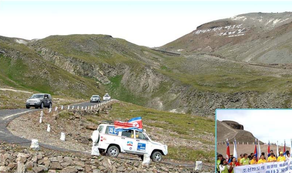
Paektu-Halla car riding took place in August 2014 in support of peace and reunification of the Korean peninsula.