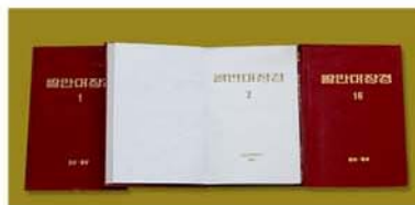
Complete Collection of Buddhist Scriptures printed with 80 000 blocks (above) and Minutes of Pibyonsa (right).