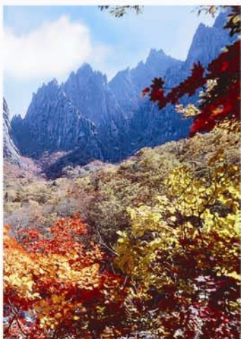
Back Cover: Jipson Peak in Mt. Kungang in autumn