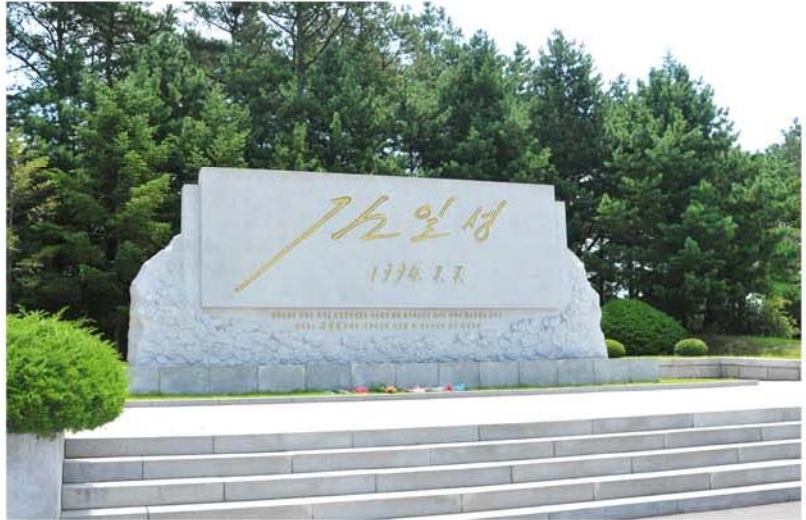
A monument inscribed with an autograph of President Kim Il Sung in honour of his exploits for the cause of national reunification.

After going round the Panmun House he went to the monument again, when he said that the President had spared no pains and achieved immortal exploits for the country's reunification indeed and that the monument was reminding him of many things. The President had worked hard for national reunification, the Chairman said, and recollected the lifelong pains and immortal exploits of the President for the country's reunification. Then he resolutely declared that they should reunify