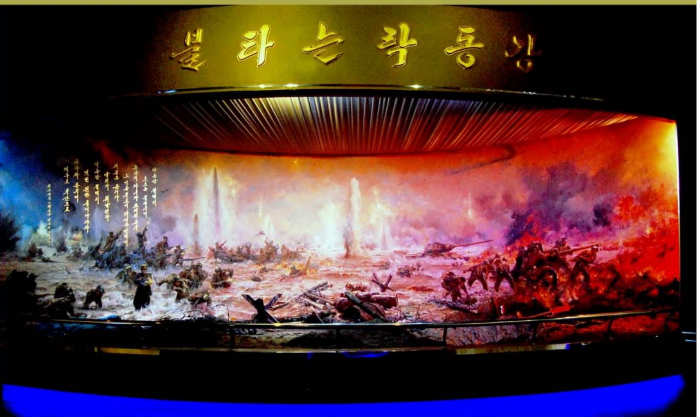
A picture of the fierce battles on the Raktong River.