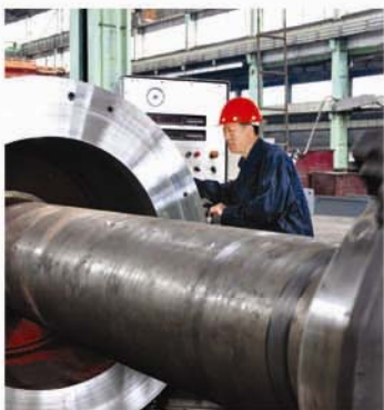
Front Cover: The Taean Heavy Machine Complex is pushing ahead with the production of generating equipment