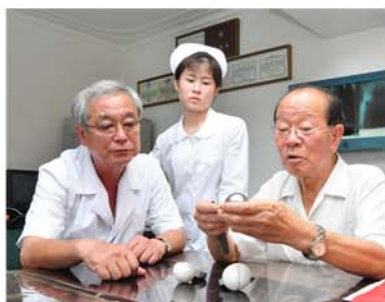
Researchers who developed the artificial femoral joint.

Seeing the old man leaving the hospital with his wife and grandchildren, some people were chatting together, "A worker of my factory had to walk with the help of a cane after his leg got