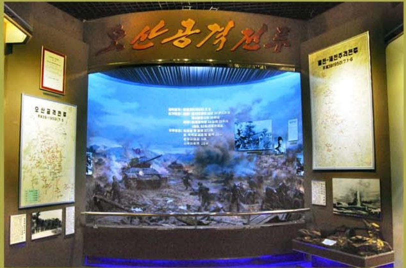
A picture of the offensive operations in Osan.

The story about the postponed time to attack Seoul was quite impressive. For fear that the Seoul citizens might be injured and the precious cultural heritage destroyed if the fight took place at night, Kim Il Sung saw to it that the battle was postponed to the next day. This fact