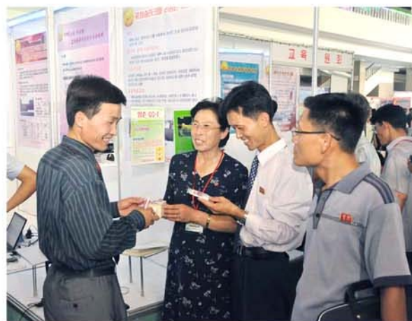
Researchers of Kim Il Sung University geology faculty attend the 29 th Central Sci-tech Festival.

First of all, they set it as their goal to develop and introduce a mineral polymer based on domestic materials to suit the current trend of localization of materials, high speed and functionality in the construction field. They pushed ahead with the research work. As a natural course of laborious research they succeeded in selecting a kind of mineral—which is in enormous deposit in their