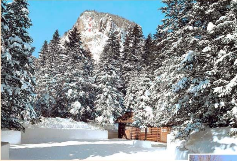
The birthplace of Chairman Kim Jong Il in the Paektusan Secret Camp, and the people on a study tour to the birthplace.