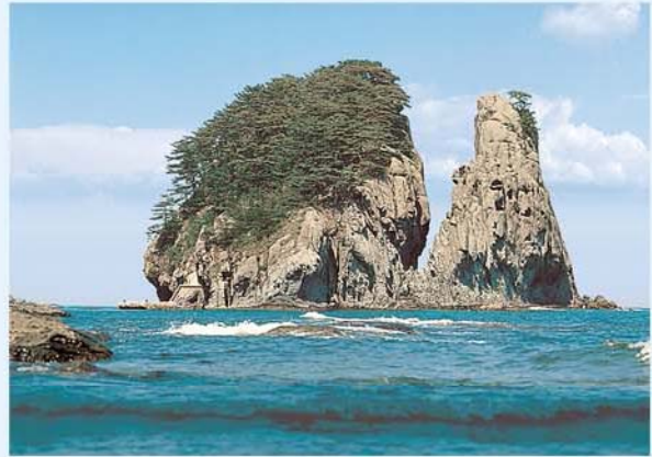
Sol Islet in Sea Chilbo.

► beautiful scenery to be enjoyed from the sea.