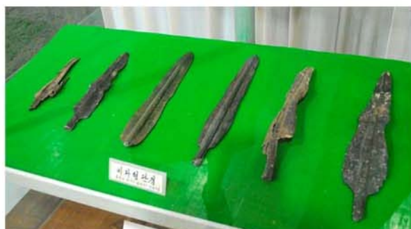
Various pippa-shaped daggers.