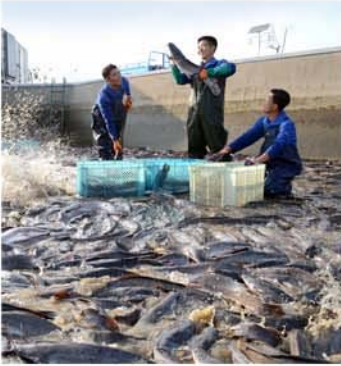
Front Cover: Big Haul of Catfish