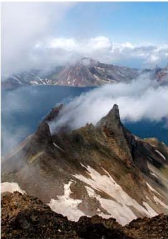
Back Cover: Piru Peak in Mt. Paektu