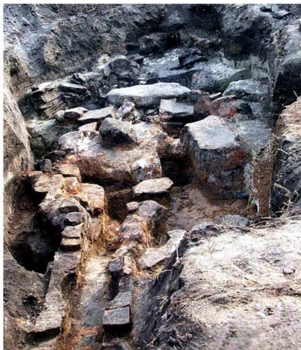
A site of salt manufacture during the time of Koguryo.