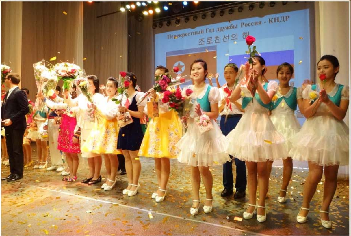
The artistic performance in the Far East, Russia, in August 2015.

▶ saying the young Korean artistes had won fame in an instant.