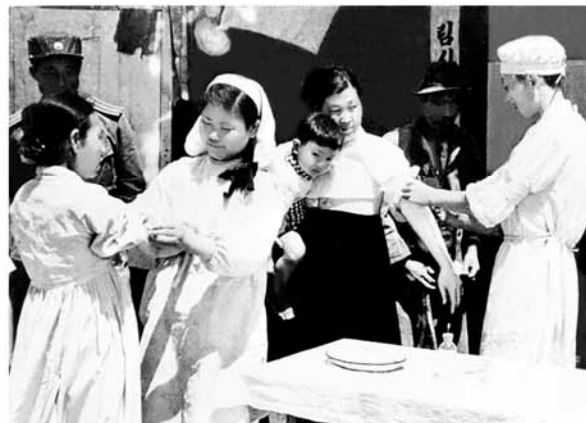
Free medical care system was introduced during the wartime.

Since then the health of the working people and children has been under better protection by the benefit of the free medical service. The right to free medical care is surely given in the DPRK Socialist Constitution and the Public Health Law. Medical care establishments and doctors are to be seen wherever there are working people, and the section