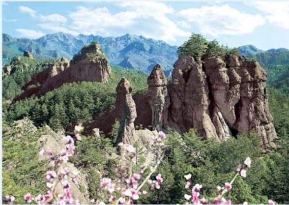
Pae Rock in Mt. Chilbo.