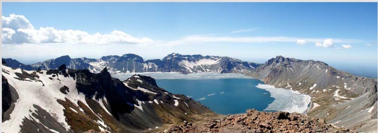
Lake Chon in Mt. Paektu.

The Great Paektu Mountains, which runs from Mt. Paektu to Mt. Halla in Jeju Island, is the main mountain range of the country. As Mt. Paektu is the starting point of the Korean topography and the