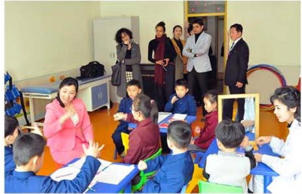
Disabled children are given early-age special education in the Korean Rehabilitation Centre for Children with Disabilities.

tarian bodies interested in donation to and cooperation for the care of the disabled and orphans, and individual figures at home and abroad.