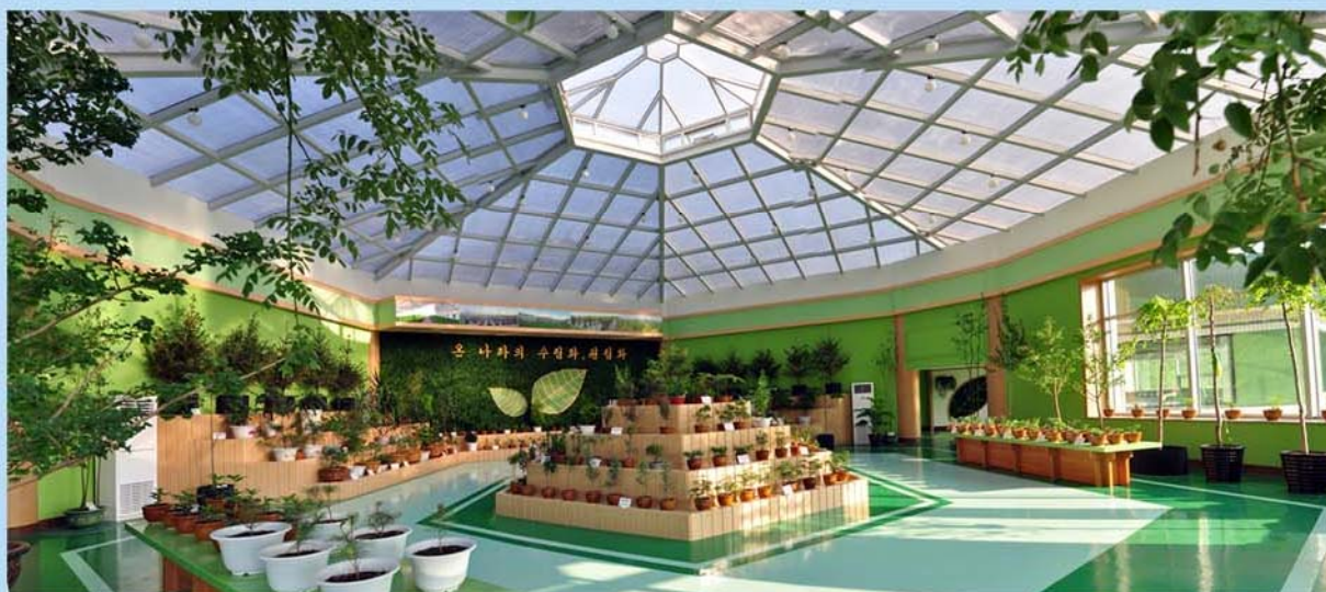
A sapling show hall.