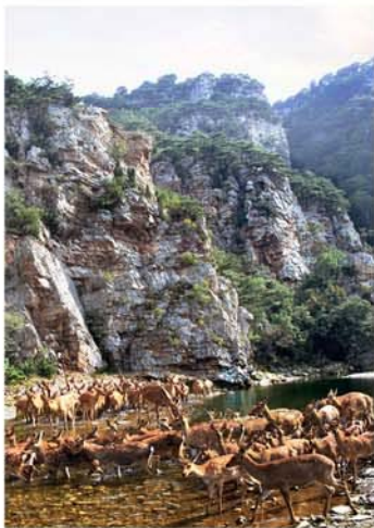
Back Cover: A herd of deer