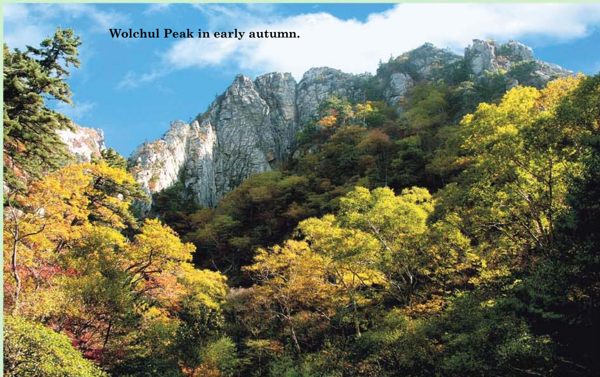
Wolchul Peak in early autumn.

Kumgang is to be found a place where a series of rocks, rising hundreds of metres in height, look like a ladder leading up to the sky. Piro Peak, the highest one in Mt. Kumgang, is of paramount importance as vantage point for sightseeing. What is particularly spectacular about the scenery of Piro Peak is to stand on it to enjoy the rising sun over the East Sea of Korea and the sight of the