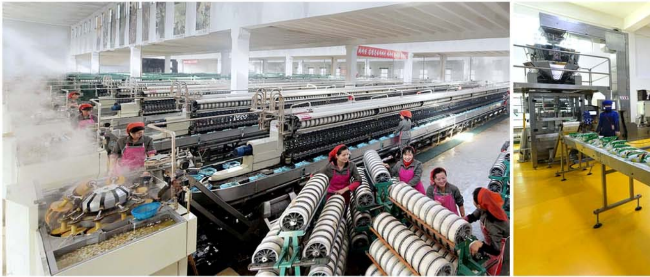
Primary effort is directed to improvement of the people's living standards.

▶ efforts to suit the actual condition. The spirit of self-development first is one of the consistent strategic ideas maintained by the DPRK. It is a revolutionary spirit of strengthening the driving force and carving out one's own destiny by relying on one's own efforts, technology and resources. It represents an independent and creative attitude with which to build a socialist power in a responsible manner relying on its own efforts, without begging any help from outside. Thanks to this idea, in Korea the overall science and technology including the cutting-edge sci-tech field is making rapid progress, the foundation of the independent economy is further consolidated and the national economy as a whole is switching over to knowledge-based economy.