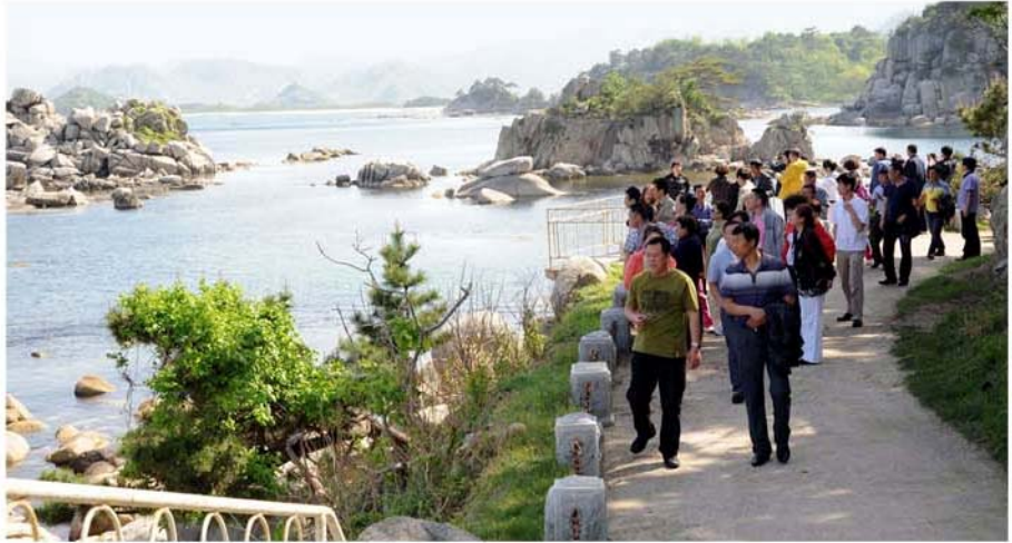
Tourists go sightseeing in Mt. Kumgang.

The Wonsan area, for example, has hundreds of scenic spots, more than 100 sites of historical importance, bathing resorts, several natural lakes, and mineral water springs, all of which arouse considerable interest among the tourists. In the vicinity of Wonsan City there are famous tourist attractions like Ullim Falls, the Masikryong Ski Resort and Sogwang Temple, which are 68, 25 and 47 km away from central Wonsan respectively. In particular Kosong County, Kangwon Province, is proud of Mt. Kumgang which is referred to as a complex of all the