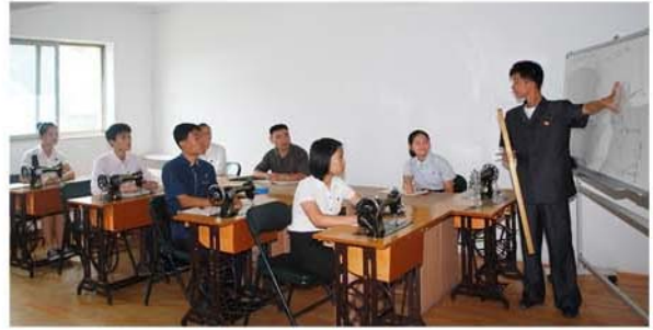
Disabled people learn at the Korean Vocational Training Centre for the Disabled.