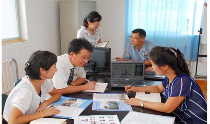
Publication and information activities are conducted for the foundation.

The State takes warm care of the disabled children, and what can I do for those children? Ri kept this thought, and when the KFDO was founded in 2010, he decided to work there. First of all, he was determined to establish a rehabilitation centre for children with disabilities and a vocational training