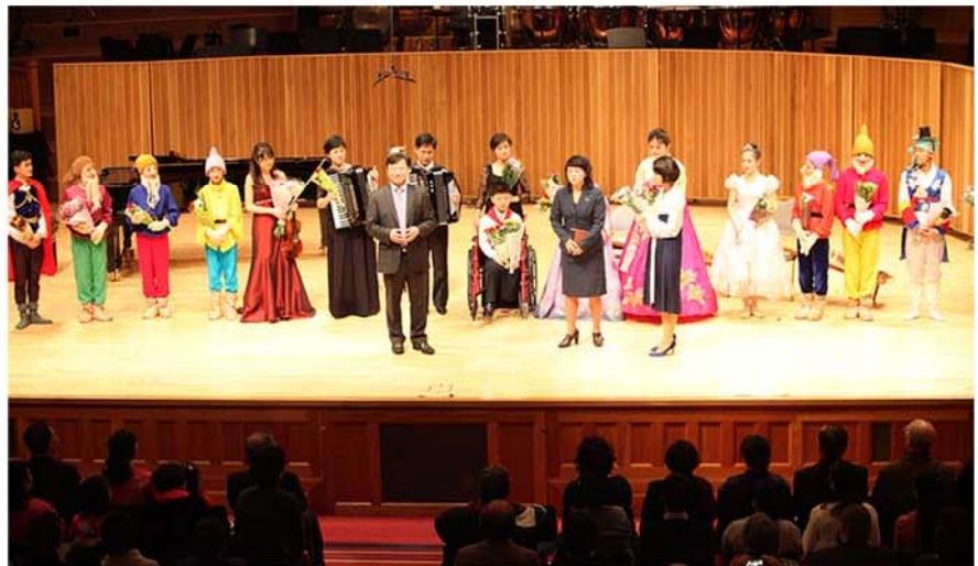
A team of disabled people from Pyongyang gives an artistic performance in Europe.