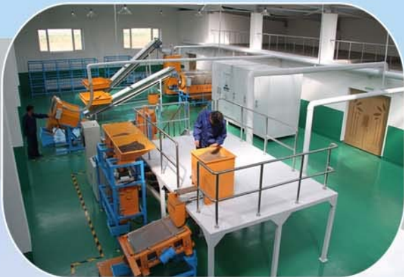
A seed selecting and treating shop.

The light-substratum shop is also wonderful. Fed with materials easily available in the country, the production, ranging from pulverization, selection, mixing, fermentation to drying, is done on a scientific and technical footing, ensuring optimal quality of the substratum.