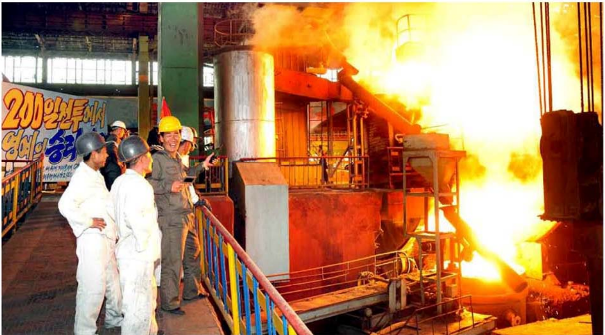
Production is on the increase at the Chollima Steel Complex.

In the DPRK the Workers' Party of Korea and the State raised it as a fundamental principle in implementing the socialist cause to adhere to the Juche character and sustain the national identity, and have observed it faithfully. This finds its expression first in the fact that the Party, the State and the people are building socialism in an independent and creative way as its master. The DPRK has carried on its socialist construction relying on its own efforts true to its ideology, faith, determination and will, instead of referring to others' established theory and experience or asking for their assistance. The WPK and the State keep Kimilsungism-Kimjongilism, the original idea of giving priority to the masses of the people, as the guiding idea. Accordingly the country solves all problems as required by the popular masses by employing the popular masses' revolutionary enthusiasm and creative ef- ▶