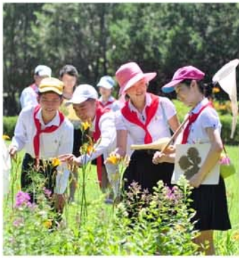
Front Cover: Observation of nature