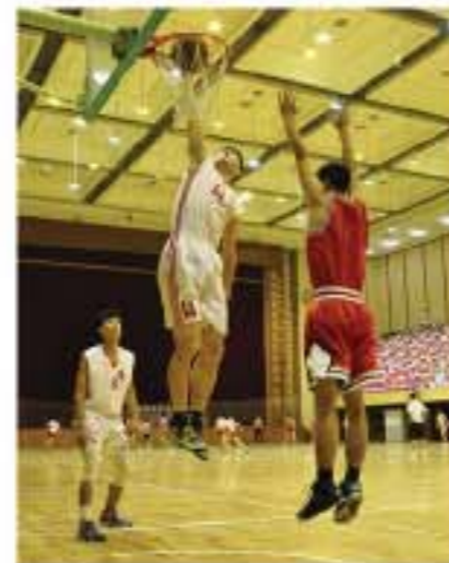
Gymnasium and swimming pool