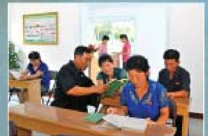
Farmers spend merry days at the holiday camp