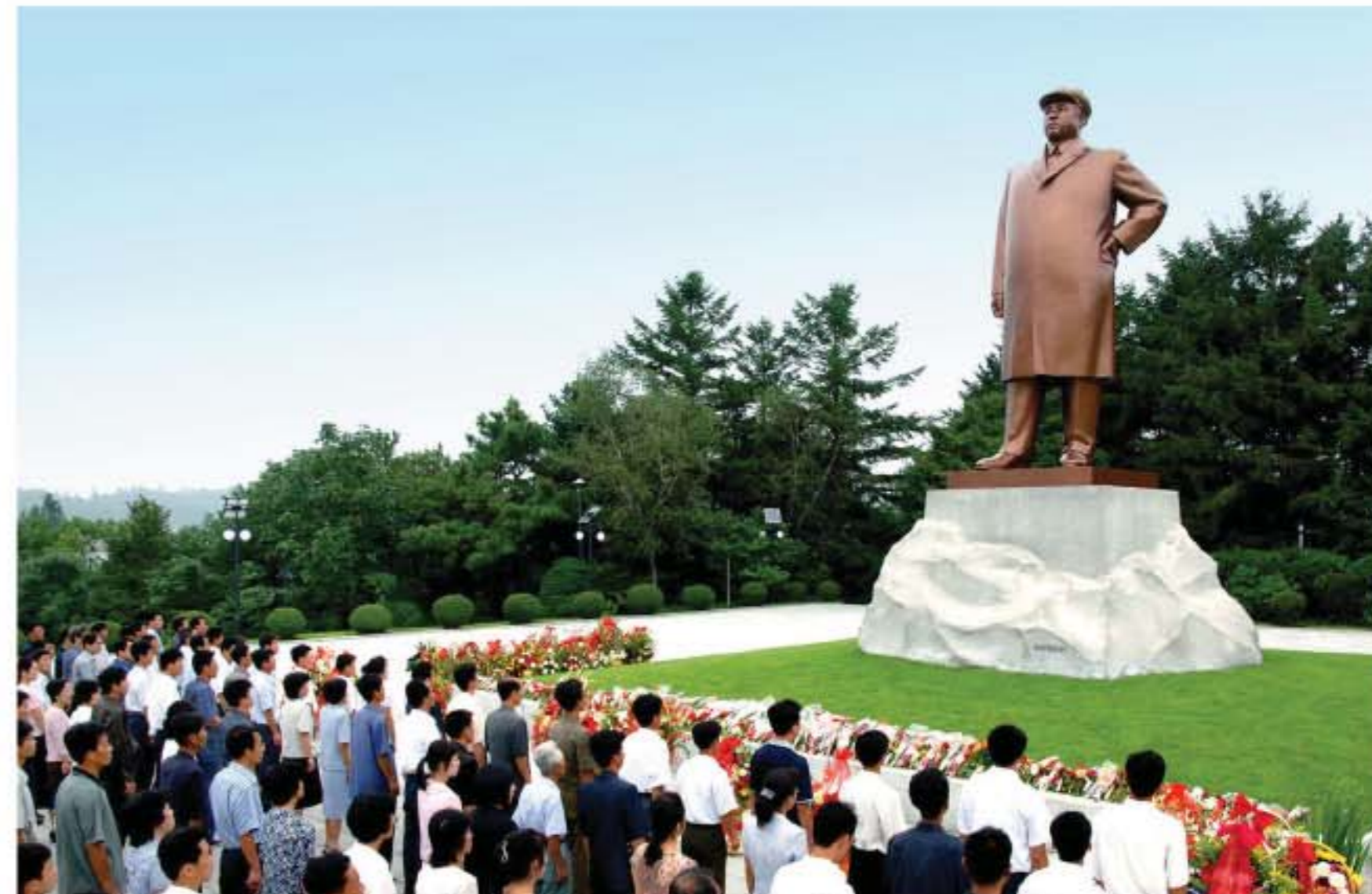
Statue of President Kim Il Sung on Ryongnam Hill