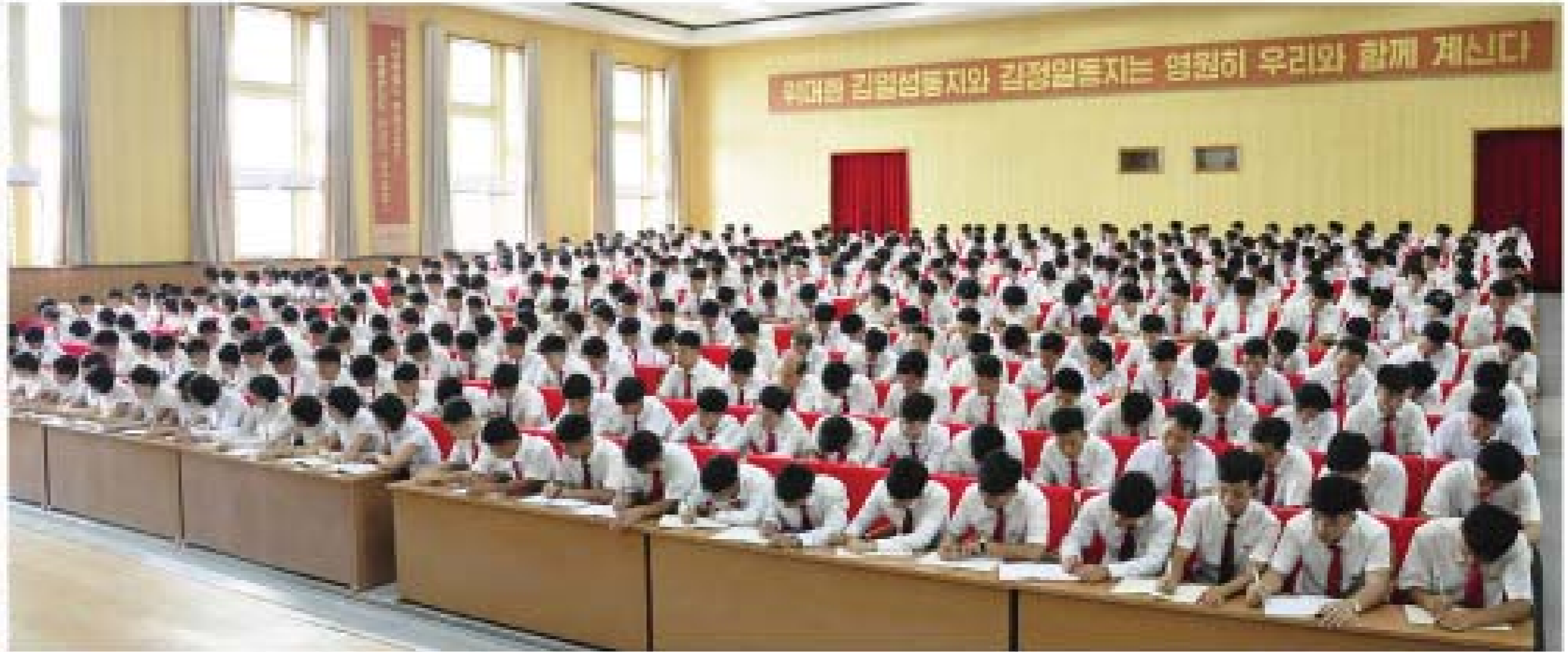
There are seven colleges of cultural, social, physical, agricultural and medical sciences and engineering, as well as scores of faculties