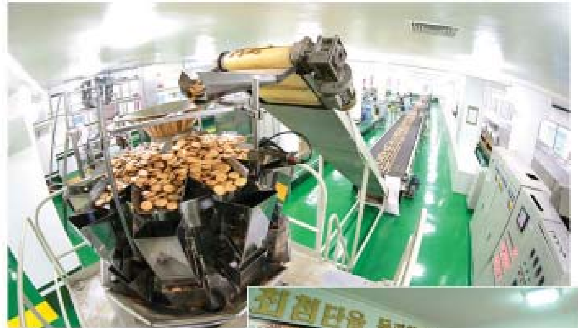
All the production processes have been automated, streamlined, sterilized and dust-free

It has fully established the quality control system based on advanced analysis and experimental equipment at the general analysis room, so as to make its food products satisfy