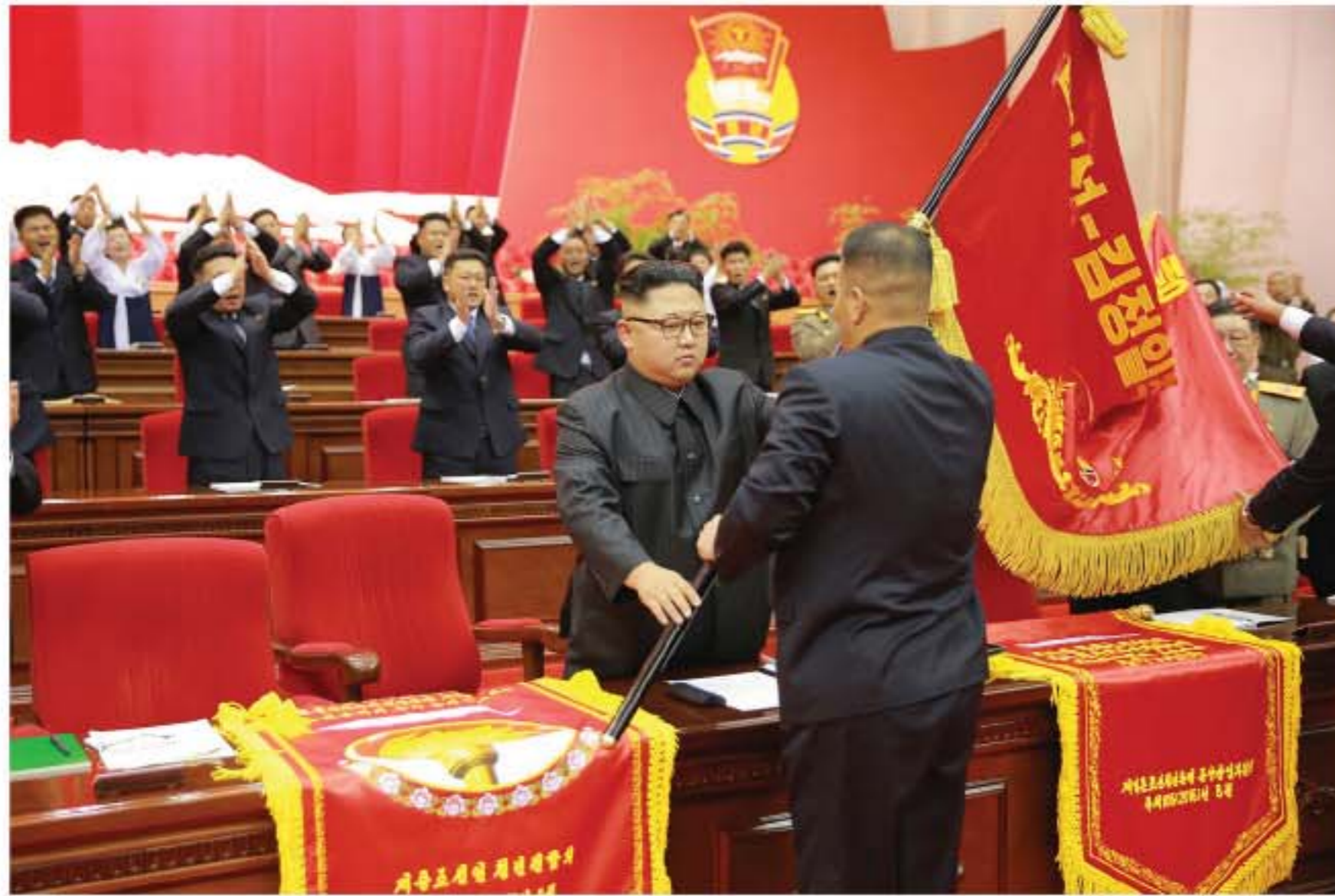
Kim Jong Un hands over the flag of Kimilsungist-Kimjongilist Youth League [August Juche 105 (2016)]

By solemnly declaring that Kim Il Sung Socialist Youth League was renamed Kimilsungist-Kimjongilist Youth League, the Ninth Congress of Kim Il Sung Socialist Youth League affirmed the invincible faith and will of the Korean young people to add eternal lustre to the undying exploits the great leaders had performed in developing the Juche-oriented youth movement and hasten the final victory of the revolutionary cause of Juche, the cause of Songun-based revolution, following the respected Kim Jong Un.