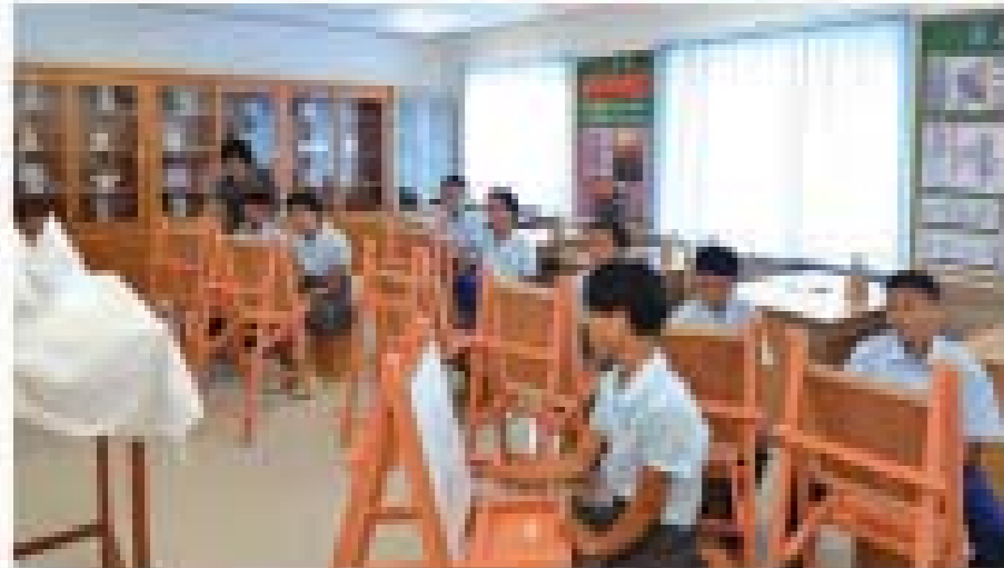
Students cultivate their talents