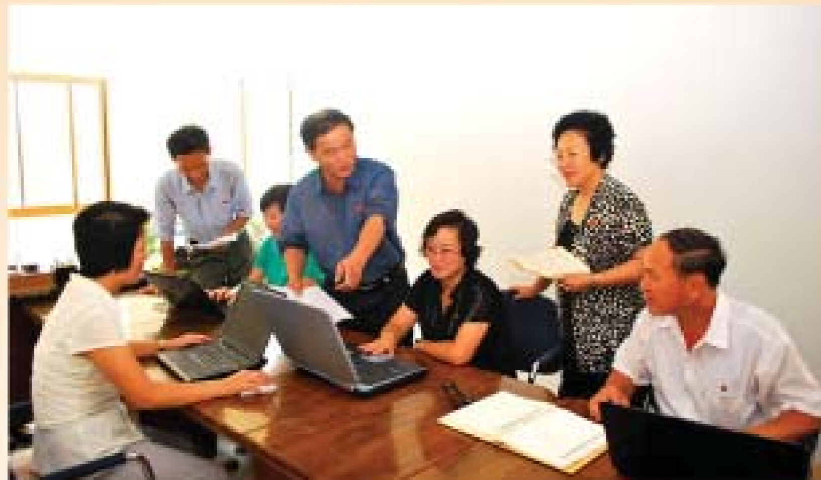
Officials of the federation discuss the plans of supporting the rest homes across the country