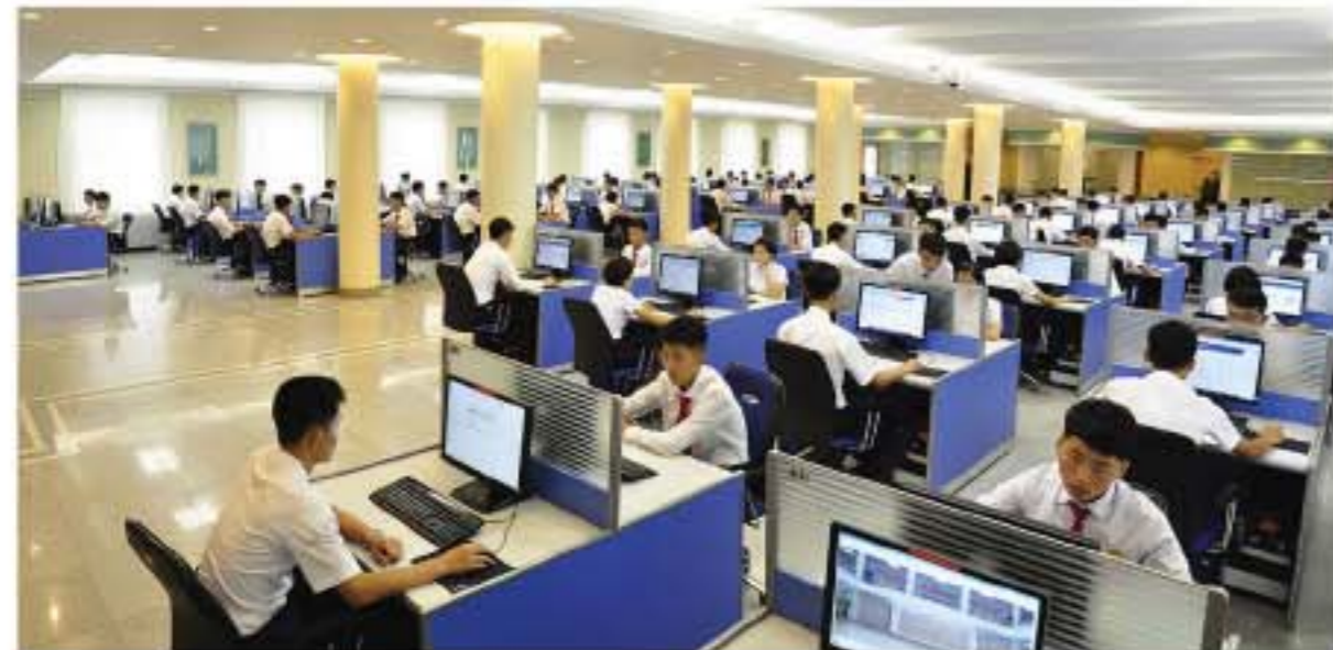
E-library (above) and natural history museum (below)