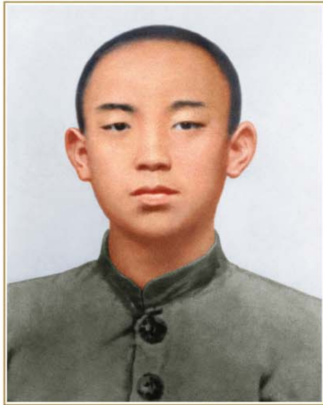
Kim Il Sung in the days when he formed the DIU [Juche 15 (1926)]

October 17 this year marks the 90th anniversary of the formation of the Down-with-Imperialism Union by Kim Il Sung, the founder and builder of the Workers' Party of Korea.