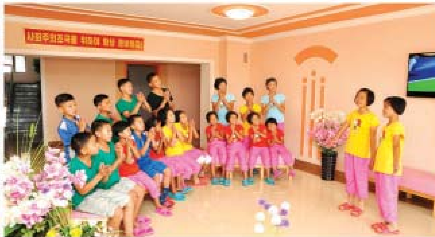
The dormitory in the evening hours is for recreations of the students