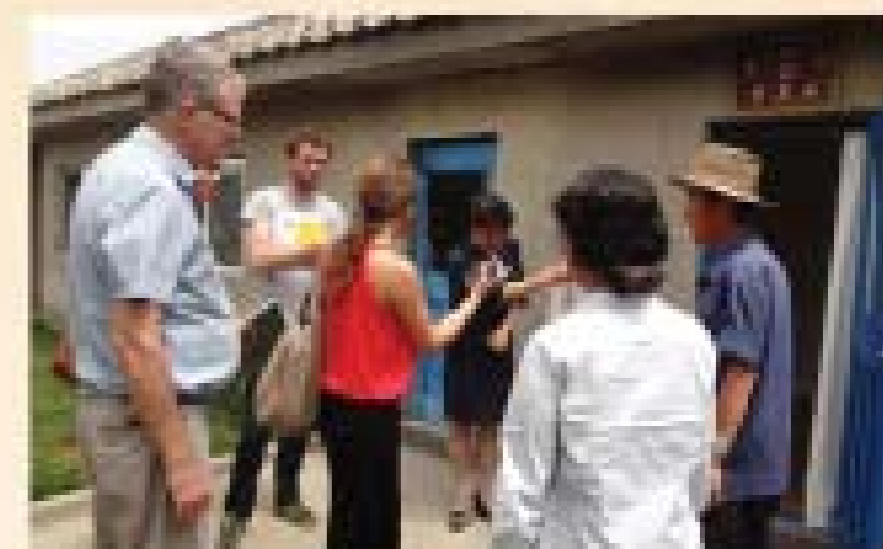
Members from the Korean federation and the EUPS conduct field surveys