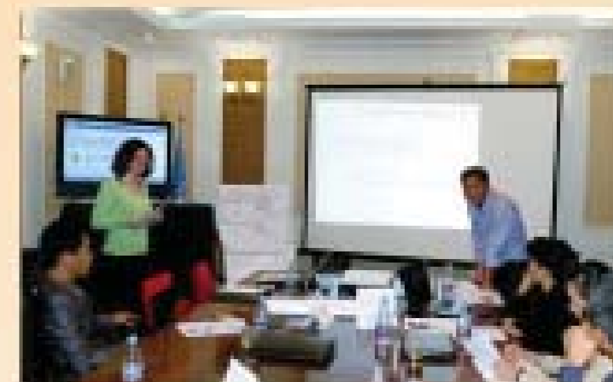
Workshops in various fields are held