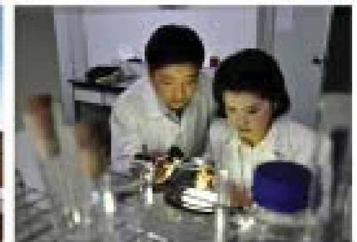
The university is furnished with research bases of several fields of science and technology