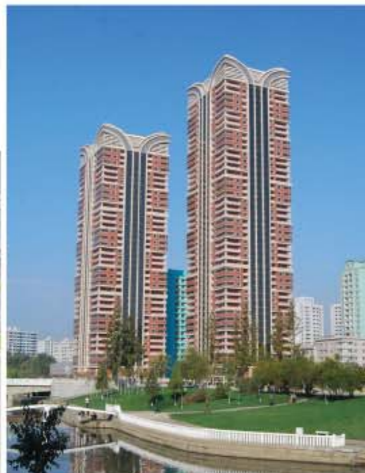
Apartment buildings for the educationists of Kim Il Sung University