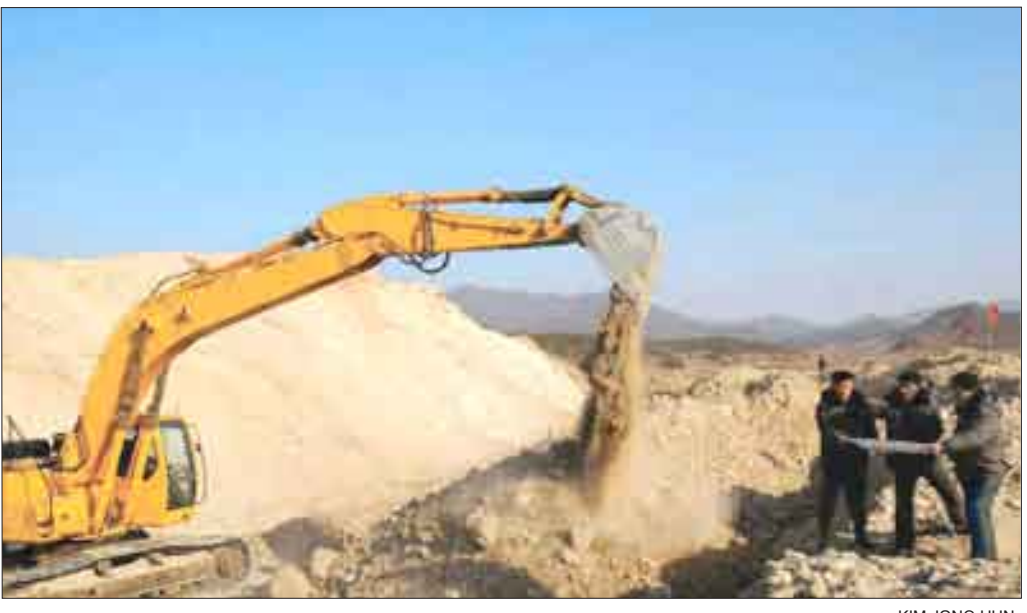
The second-stage waterway project in South Hwanghae Province progresses apace.