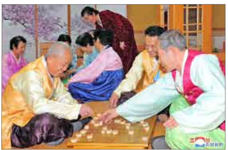
Old men play janggi , or Korean chess, at the Pyongyang Old People's Home.

Samguksagi (Chronicles of the Three Kingdoms) records that "Packje King Kungaeru was very fond of janggi and paduk (go)". Kungaeru was the 21st Packje king who ruled the country between 455 and 475. Such record suggests Korean chess already existed in the fifth century.