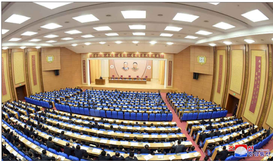
Senior Party, government, economic and military officials meet in Pyongyang to discuss how to carry out the new strategy set forth at the Third Plenary Meeting of the Seventh WPK Central Committee.