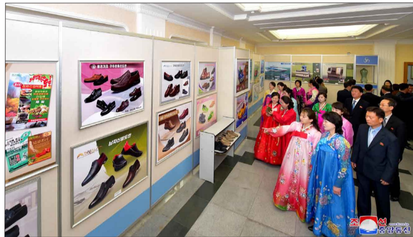
Viewers look at the industrial designs with interest.