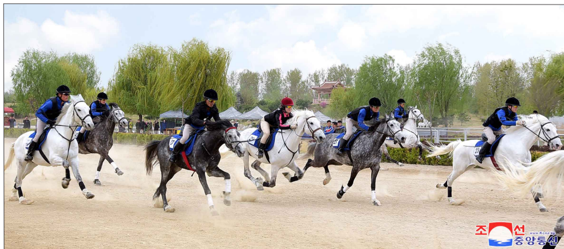
Riders put spurs to their horses.