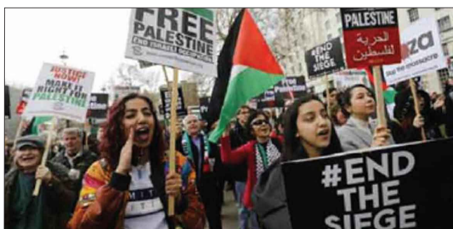
An anti-Israel protest in Britain.