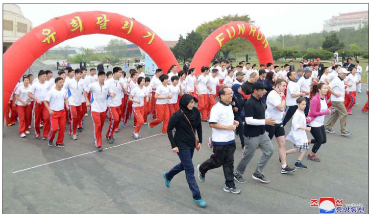
The fun run of the 18th Asian Games is held in front of the Weightlifting Gymnasium in Chongchun Street.