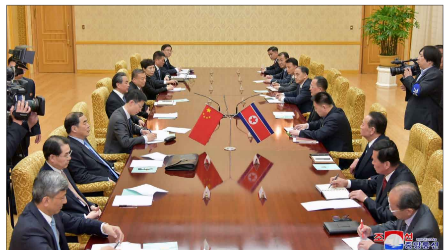
DPRK Foreign Minister Ri Yong Ho holds talks with Wang Yi, state councillor and foreign minister of China, at the Mansudae Assembly Hall.