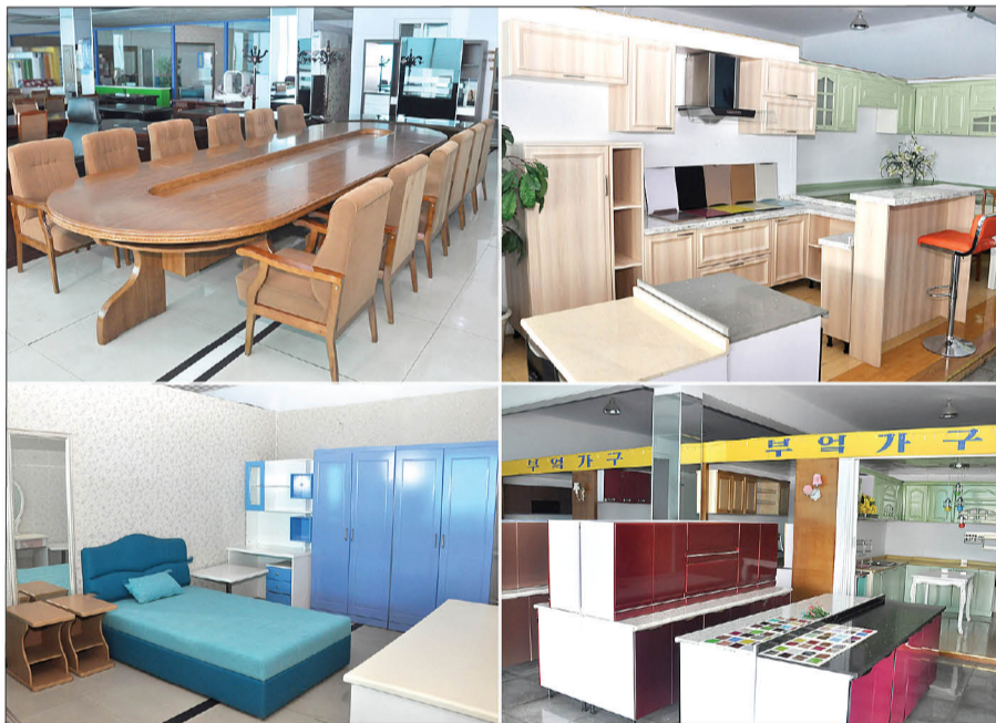
Different sets of furniture manufactured by Yonggwang furniture and building-materials company.