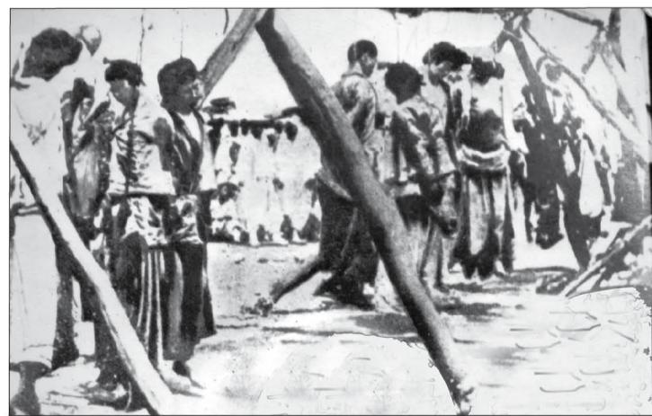
Many uprisers were hanged in group by Japanese.