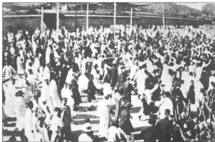
Lots of Koreans turned out for the March 1 1919 Popular Uprising.