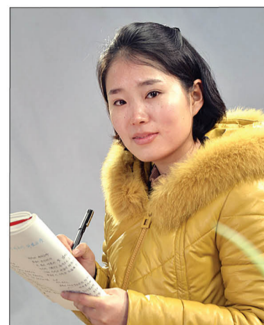
THE PYONGYANG TIMES

That night she wrote a diary: "The work of fuel supplier is not an easy job and young women are somewhat ashamed of the job. If I write poems with no working