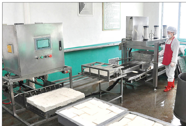
The bean curd production line at the Pyongyang Children’s Foodstuff Factory.