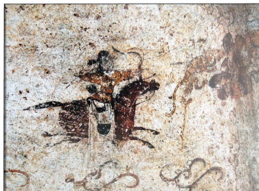
A tomb mural from the period of the Koguryo Kingdom shows a person hunting.