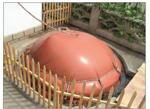
A float-type methane gas tank.