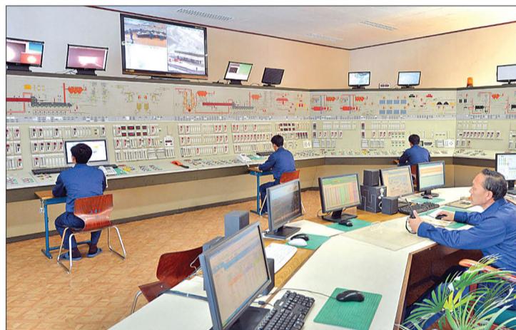
Employees monitor the production processes at the Sangwon Cement Complex.