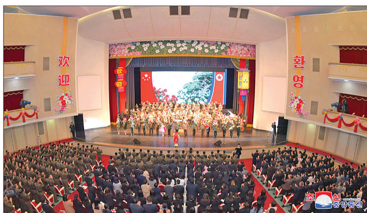
The audience give a standing ovation to the artistes of the Chinese People's Liberation Army after performance.

Four rounds of summit meetings and talks were held in a little over a year and bilateral relations developed into special ties of helping and caring for