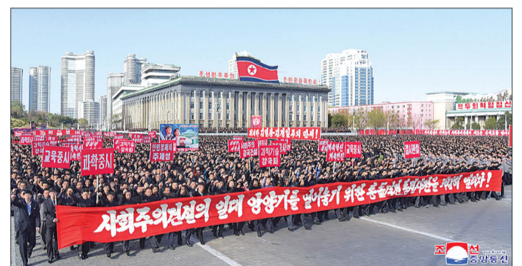
Pyongyang citizens gather at Kim Il Sung Square in support of the appeal of the Kangwon provincial people.

each other like a family, drawing the attention of the world.