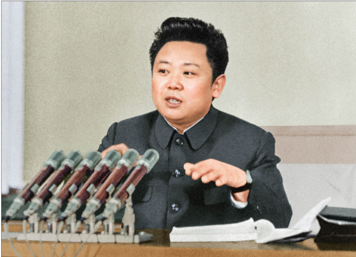
Kim Jong Il delivering a concluding speech at the Third Conference of Ideological Workers of the Workers' Party of Korea in February 1974.

He formulated the revolutionary idea of President Kim Il Sung as Kimilsungism by conducting energetic ideological and theoretical activities before anything else. And he paid primary attention to strengthening and developing the WPK into a powerful party that advances the cause of independence