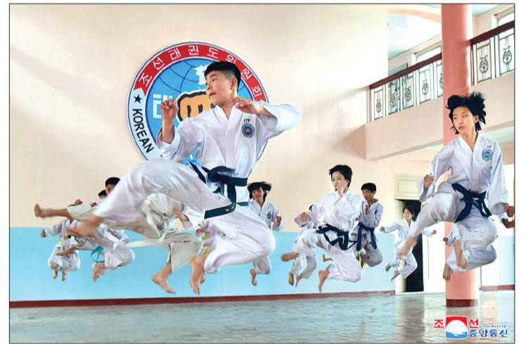
Schoolchildren practise Taekwon-Do, Korea's traditional martial art.