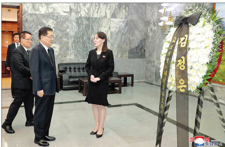
The wreath sent by Supreme Leader Kim Jong Un is given to the south side at Panmunjom.