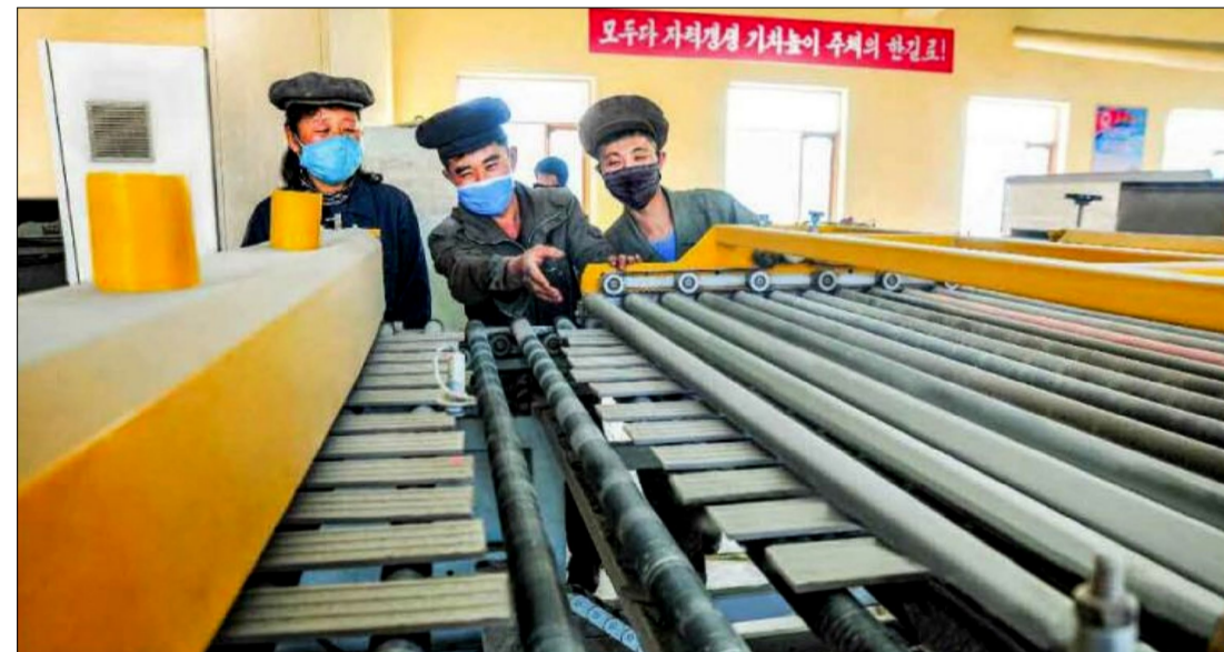
Workers pool their efforts to update a production process at the Kyongsong Tile Factory.

carbonization and destruction of the composition of medicines by overheat during the inspissation and improve the actual extraction rate in concentration of extracts. And it devised a first-aid kit composed of medicines, medical supplies, breather for artificial respiration and other tools for medical treatment and directions for first aid to provide for such an emergency as sudden attack of illness or natural disaster. Other units, including the Yomju youth tideland farm and pit No. 5 of the Ryongsan Coal Mine, also provided a sure guarantee for the production growth by holding fast to scientific and technical development and closely combined the work to improve the level of technical skills of their employees with the operation of scientific and technical diffusion rooms, thus winning the title of model technical innovation unit.