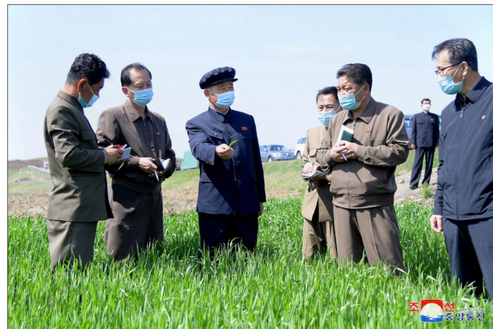
Premier Kim Tok Hun (third from left) inspects the Ponghak Vegetable Farm under the Rural Economy Committee of South Phyongan Province.

The field consultative meetings discussed the issue for officials in the sectors of metal and chemical industries to intensify scientific and technological guidance to major projects and push forward with the