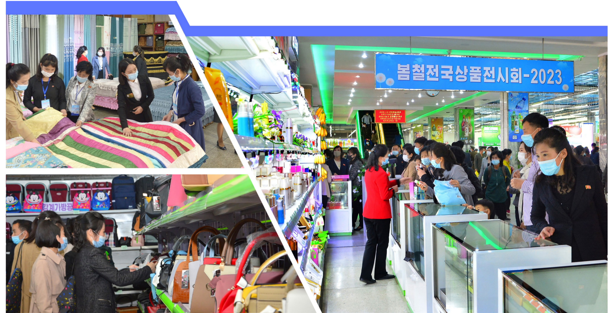
Many people visit the spring national commodity show-2023 held from April 28 to May 9.