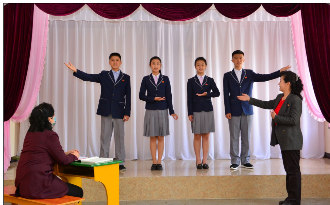
Students acquire speaking and acting skills at the early acting education class of Changgwang Senior Middle School in Central District, Pyongyang.

diverse speaking and acting skills peculiar to them as they imitate various styles of acting and diverse tones like clear, thin, deep, thick and hoarse voices. The class also pays due attention to the training of music and rhythm with the main stress put on national music and dance to make personality and aura peculiar to Koreans emanate from students in their acting. At present, the class works hard to find out the ways to further improve the quality and level of education in keeping with the trend of developing dramatic and cinematic arts including teaching methods to prepare students as scriptwriters and directors as well as actors.