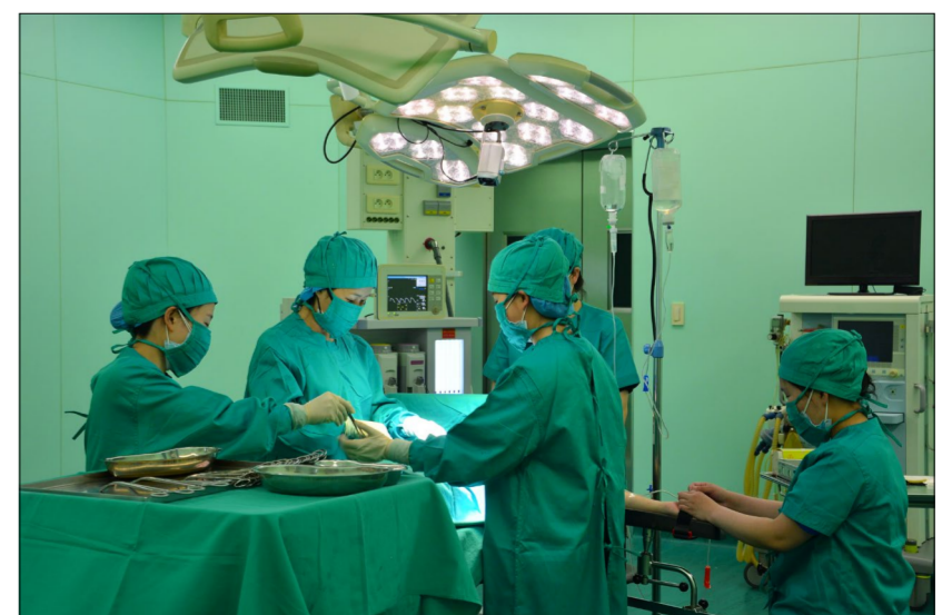
Medical workers have an online diagnosis consultative meeting and perform an operation at the Breast Tumour Institute.