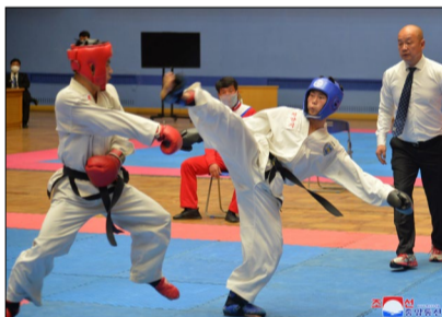
A Taekwon-Do player of the Pyongyang municipal team makes a kicking attack in the sparring event.

Those who rendered distinguished services in the event were goalkeepers. The spectators burst into enthusiastic applause when they blocked shots or narrowly saved them.