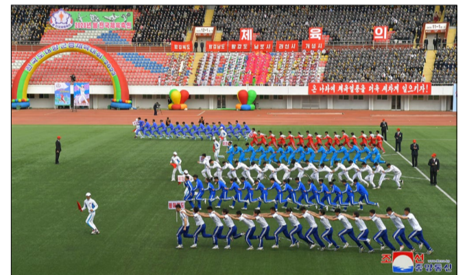
Players from provinces display collective power in the leg-tied race in the National Inter-provincial Games-2023.