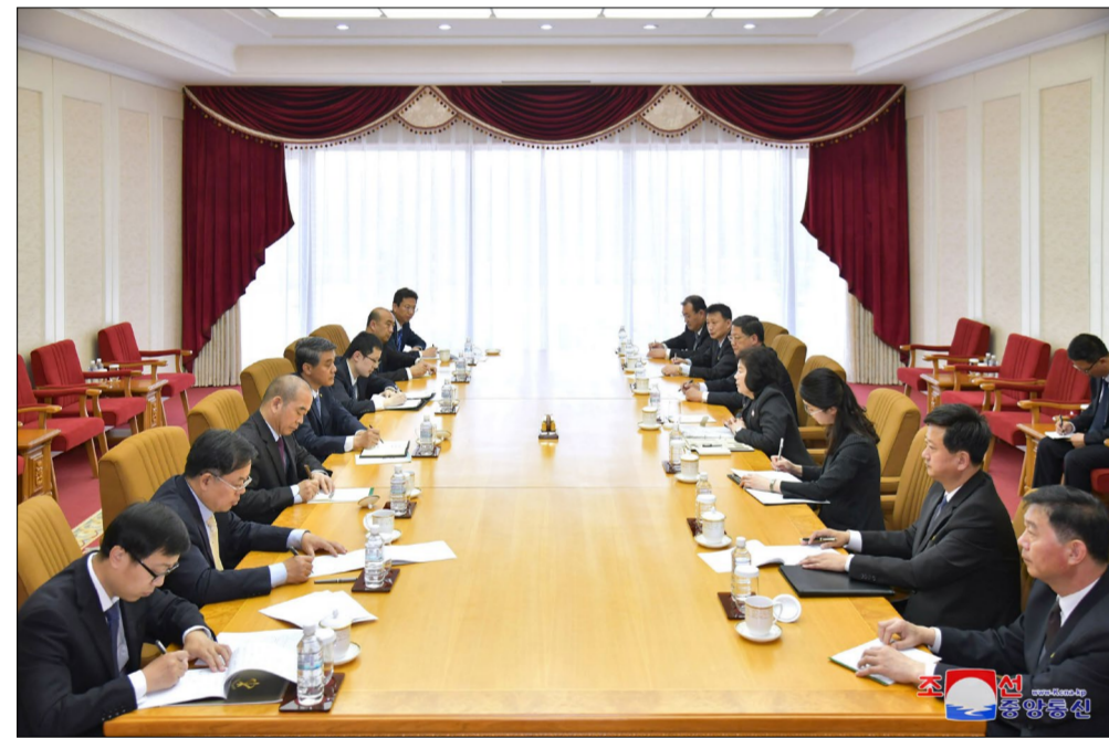
DPRK Foreign Minister Choe Son Hui has a talk with Wang Yajun, new Chinese ambassador to the DPRK, who paid a courtesy call on her on May 8.

work for readjustment and reinforcement as planned and the issue for relevant units to produce and supply equipment and materials needed for projects in time.