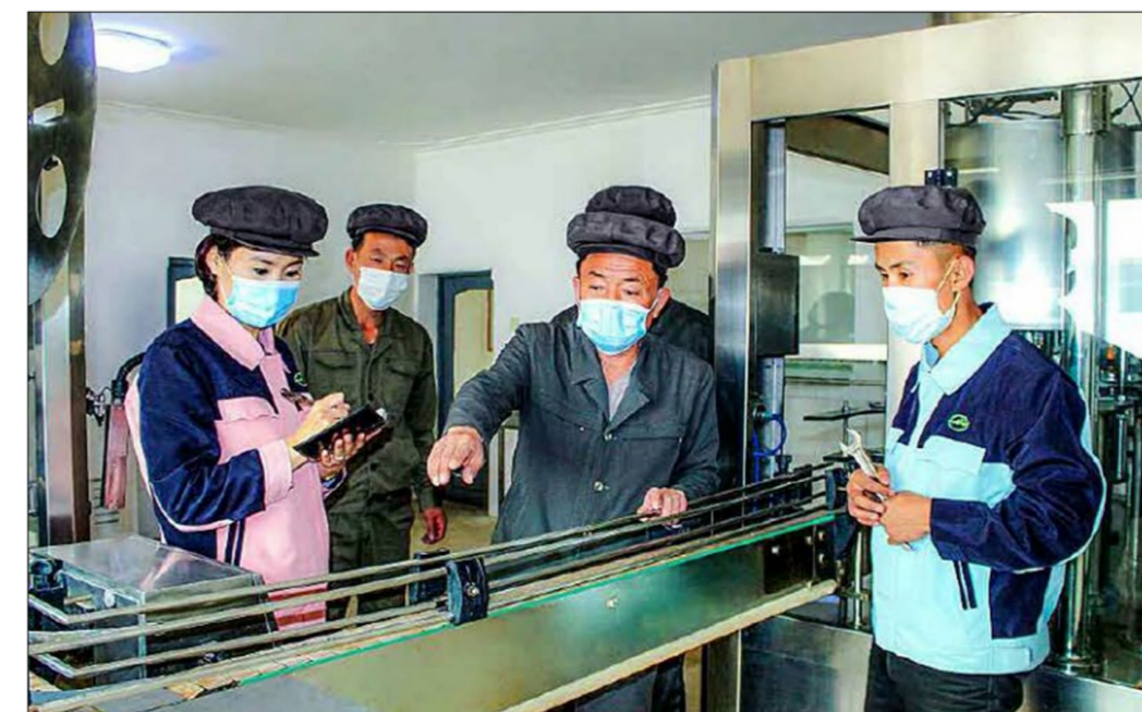
Technicians discuss ways to upgrade production lines at the Tachongdan County Potato Processing Factory.

As a result, its starch production capacity has remarkably been increased, the modernization of production processes has been realized on a higher level and progress has been made in ensuring the domestic production of key materials and the development of new products.