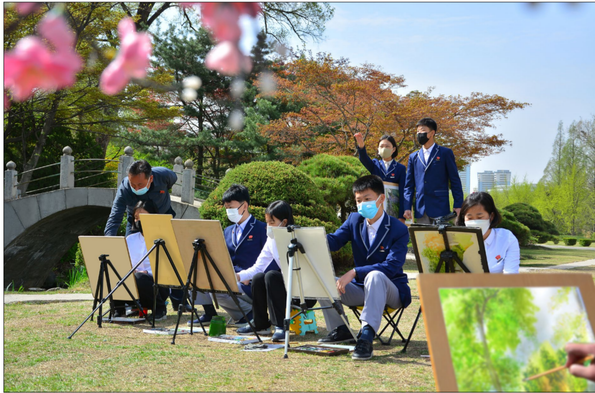
Students of the special course of Pyongyang University of Fine Arts practise their painting skills on Moran Hill in Pyongyang.