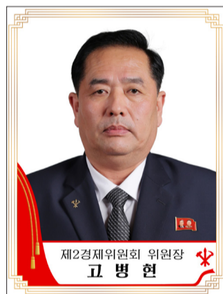
Ko Pyong Hyon