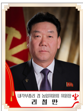
Ri Chol Man

Vice-Premier of the Cabinet and Chairman of the Agricultural Commission Ri Chol Man, Vice-Premier of the Cabinet Kim Myong Hun, Minister of Land and Environment Protection Kim Kyong Jun, Minister of Railways Kuk Myong Ho, Minister of Public Health Jong Mu Rim, Minister of Mining Industry Ri Sang Do, Chairman of the State Commission of Science and Technology Ri Chung Gil, Director of the Central Public Prosecutors Office Kim Chol Won, President of Kim Jong Un University of National Defence Jon Il Ho, and Chairman of the Second Economy Commission Ko Pyong Hyon.