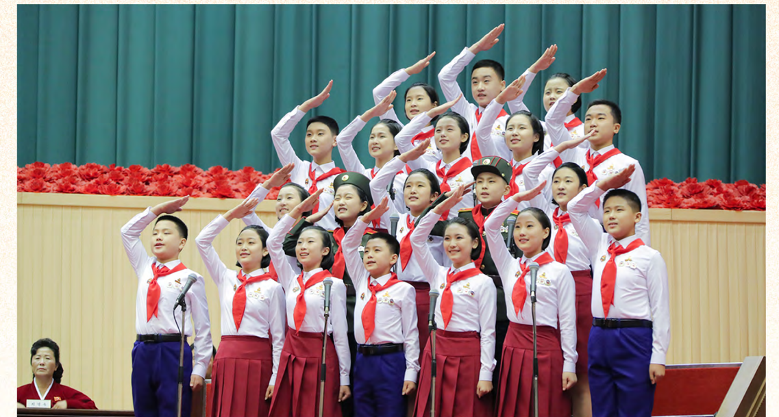
The congratulatory group of the Korean Children's Union reciting a congratulatory poem "We extend glory to the great mother"

socialist construction and a changed ideal society to come in near future.