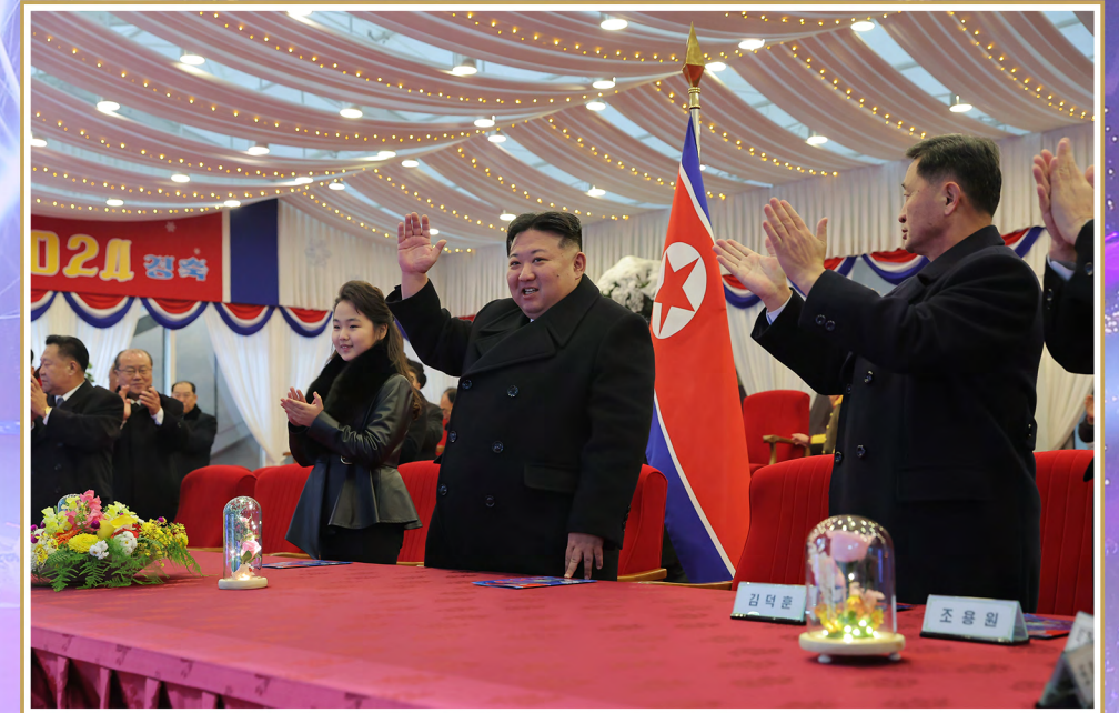
Kim Jong Un waves back to the enthusiastically cheering crowds as a token of his warm greeting of best wishes to all the audience and all the beloved people of the country seeing in the New Year.

He waved back to the enthusiastically cheering crowds as a token of his warm greeting of best wishes to all the audience and all the beloved people of the country seeing in the New Year.