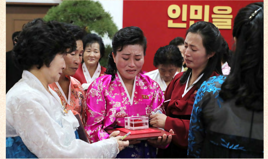
The newly-enacted Communist Mother Honour Prize awarded to the women who have made distinguished contributions to the prosperity of the country