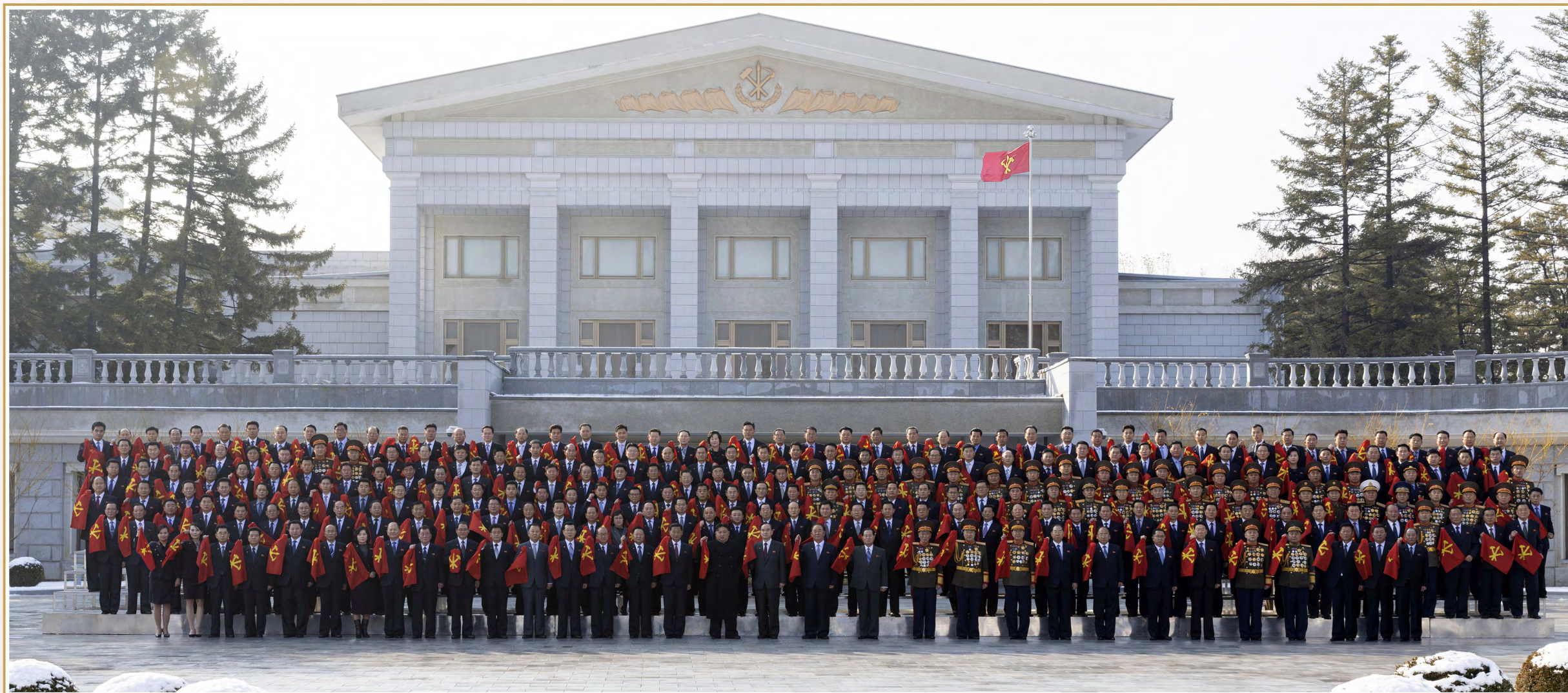
Kim Jong Un has a significant photo session with members of the leadership body of the Party Central Committee.