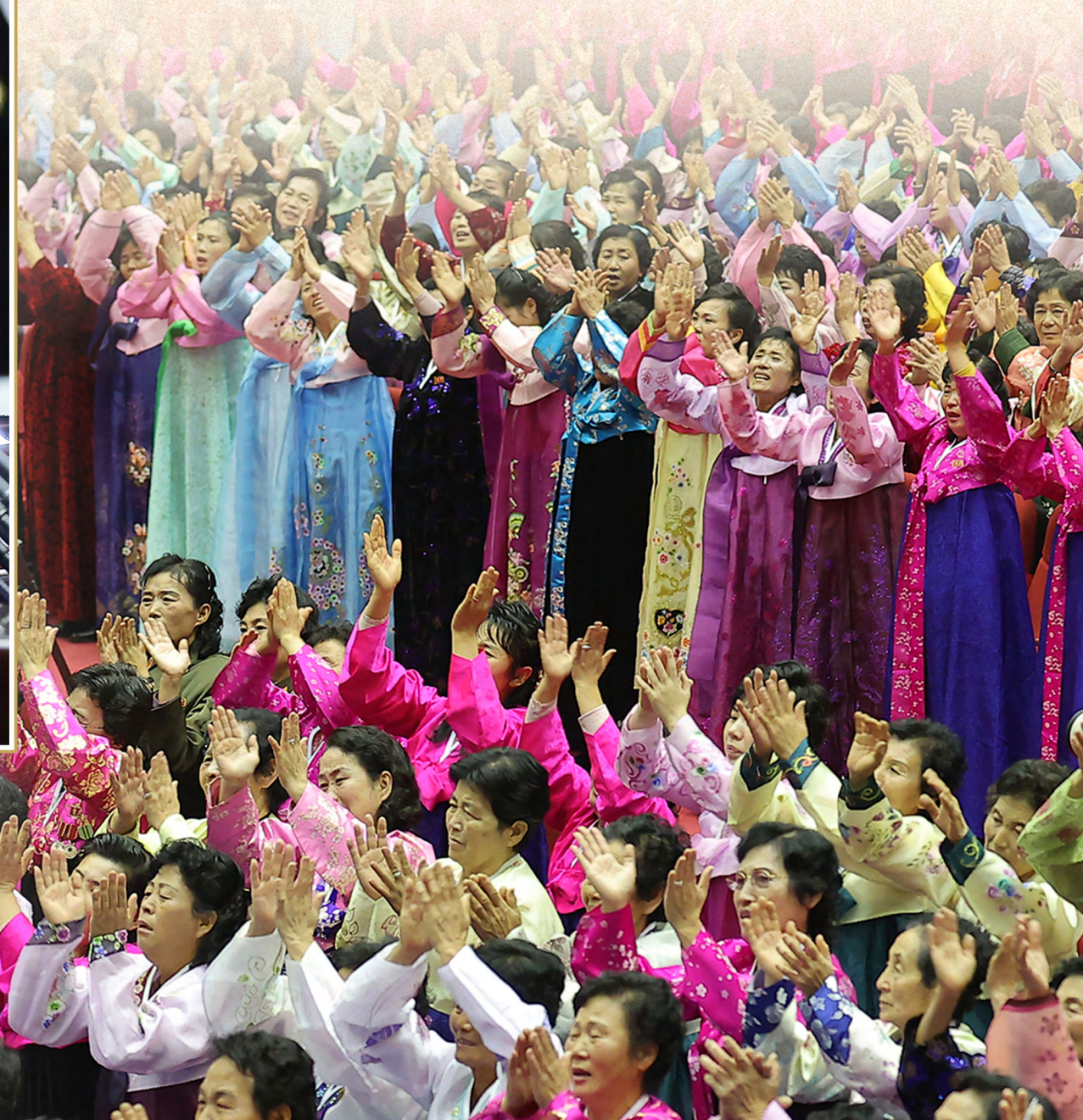
Kim Jong Un, general secretary of the Workers' Party of Korea and president of the State Affairs of the DPRK, attends the conference.

Saying that the small family groups the mothers have built up with such care out of a feeling of patriotism constitute a cornerstone that firmly supports the country, thanks to which the great socialist family remains solidly united and the country continues to grow in strength and highly appreciating that this is an enduring exploit performed by the mothers in Korea for the Party, the revolution and the country, Kim Jong Un, on behalf of the Party Central Committee and the Government of the Republic, offers his heartfelt gratitude and best wishes to all those present at the conference and to all other mothers in the country.