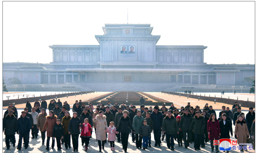
People of all social standings visit the Kumsusan Palace of the Sun (right). Colourful performances take place across the country (below).

Art troupes and schoolchildren also gave performances to celebrate the significant holiday at the Pyongyang Indoor Stadium, Changjon Crossroads and other places.