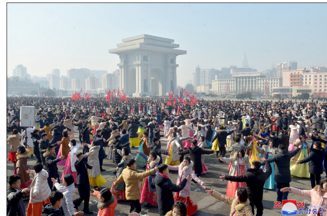
A dance party is held by youth and students at the plaza of the Arch of Triumph in Pyongyang.

Similar events were held in the provincial capitals on the same day.