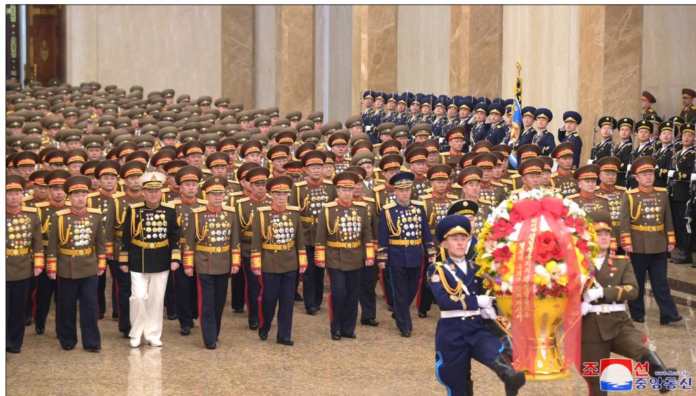
Commanding officers of the Korean People's Army visit the Kumsusan Palace of the Sun to pay homage to President Kim Il Sung and Chairman Kim Jong Il.