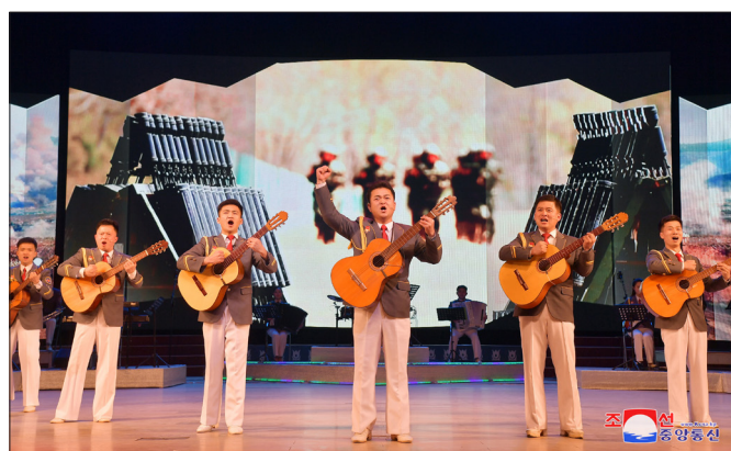
The artistic information team of the youth league central committee gives a performance at the Central Youth Hall on February 7.

forces and provided a sure military guarantee for the prosperity of socialist Korea.