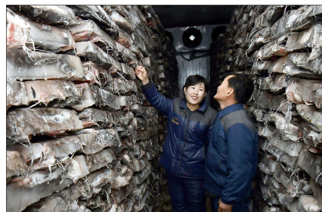
The major sectors of the national economy seethe with activities to successfully attain production goals for the first month of the year.