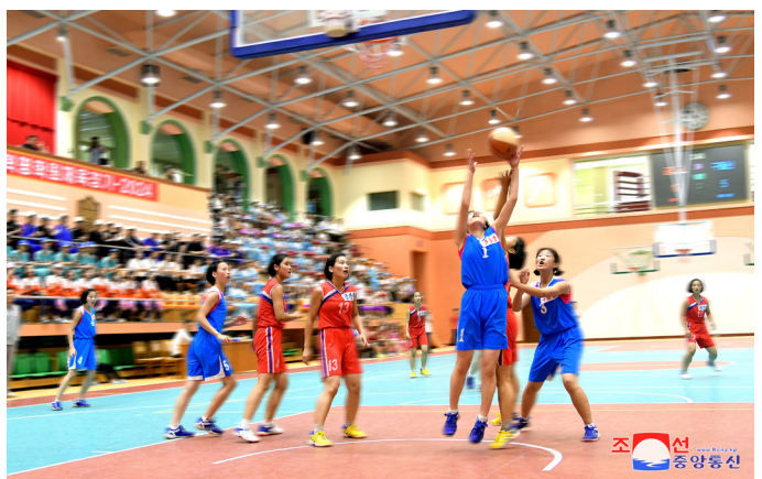
The Sports Contest of Revolutionary Schools-2024 takes place at Mangyongdae Revolutionary School between June 17 and 23.