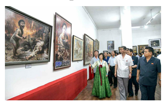
An art exhibition on the theme of class education is held at the Pyongyang International House of Culture on June 24.