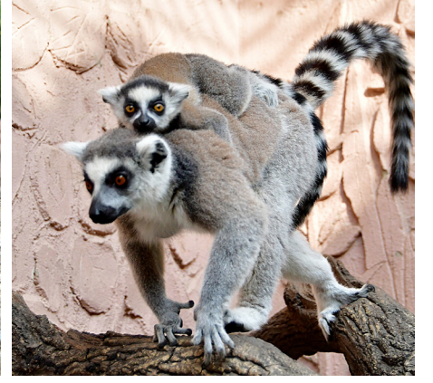
Many gift animals produce their younglings at the Central Zoo in Pyongyang.