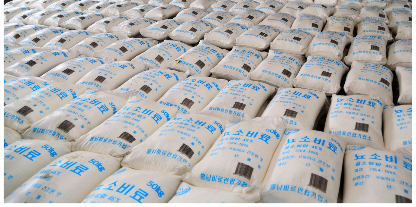
A large quantity of fertilizer is produced and supplied to farms every day by the Hungnam Fertilizer Complex.

The Namhung Youth Chemical Complex has increased the output of fertilizer by over 300 tons on a daily average as compared to last year. In particular, the gas cleaning process, which was readjusted last year true to the Workers' Party of Korea's strategy for readjustment and reinforcement, has proved effective.