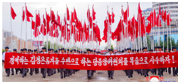
Mass rallies are held in provinces, cities and counties on June 25, the day of struggle against US imperialism.