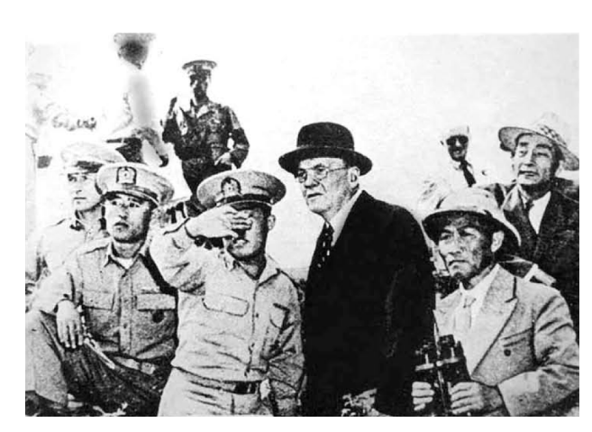
Dulles on a visit to the ROK to finally oversee the preparations for starting the Korean war.