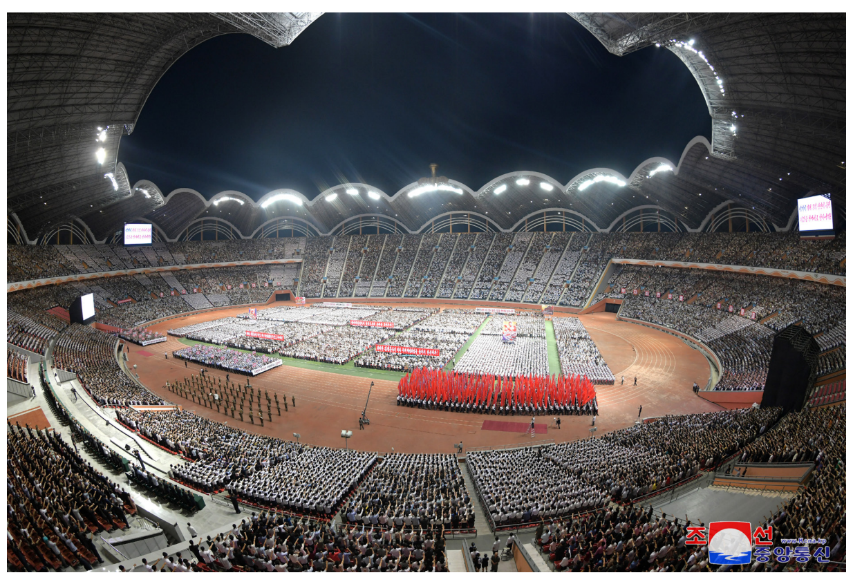
A Pyongyang municipal mass rally takes place at May Day Stadium on June 25, the day of struggle against US imperialism.

The speakers, in reflection of the retaliatory spirit of all the people, expressed their will to annihilate the US imperialists and the ROK puppets, the unchangeable arch enemy, at any cost, bitterly