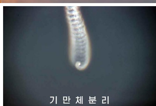
The separation and guidance control test of individual mobile warheads is carried out successfully on June 26, which is of great significance in attaining the goal of rapidly developing the missile technologies.